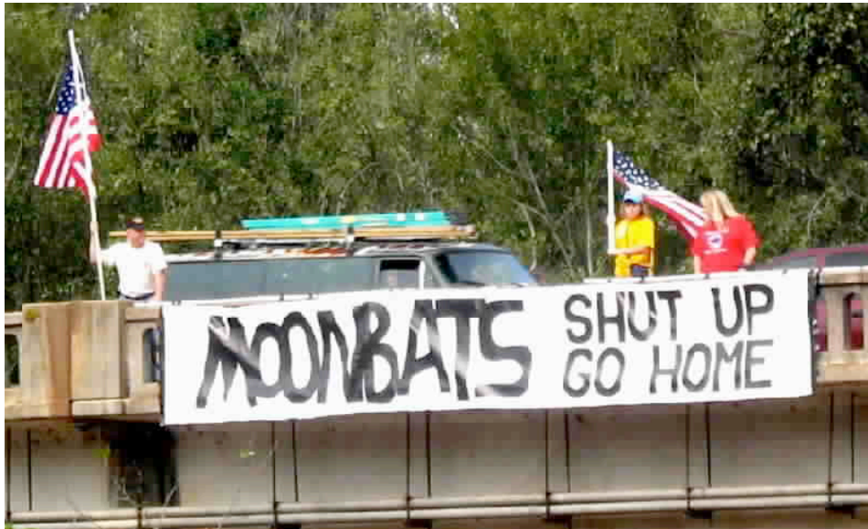
Fig. 17. GOE-Shut Up Go Home. Chuck Fager. Doves & Eagles . 27 Oct. 2007. Web. < http://www.quakerhouse.org/smithfield-rally-03.htm >

. . . When we finally arrived at the Town Commons, the counterprotesters set up on the sidewalk across the street from the park. More amplified yelling, air horns, and whistles. . . . I looked around the grounds (it was still wet from the rain) and started visiting some of the exhibits. It was hard to hear what people were saying over all the yelling and noise across the street. And then I saw the banner hanging from the bridge “Moonbats Shut Up Go Home” (see fig. 17). Now what a Moonbat is, I’m not sure, but I assume it’s not a kind epithet. 23 More counterprotesters were on the bridge next to the banner encouraging drivers to honk their horns.