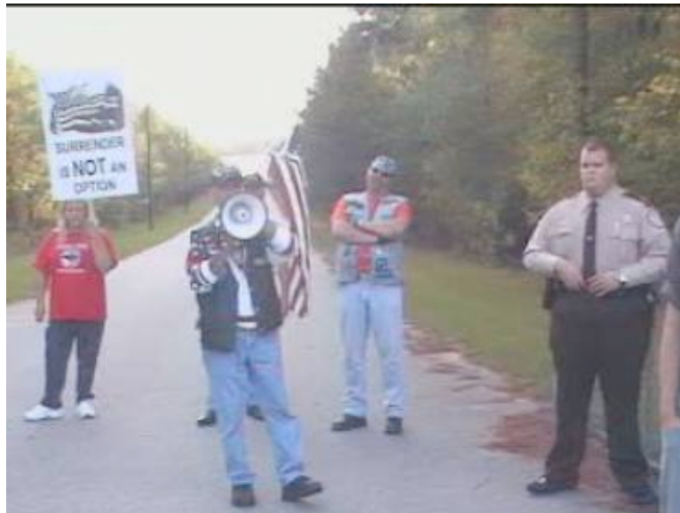
Fig. 21. GOE with megaphone. NCSTN. Walk of Remembrance . 27 Oct. 2007. Web. < http://ncstn.spaces.live.com >

Four counterprotesters walked to the front of the road with a megaphone. (see fig. 21).