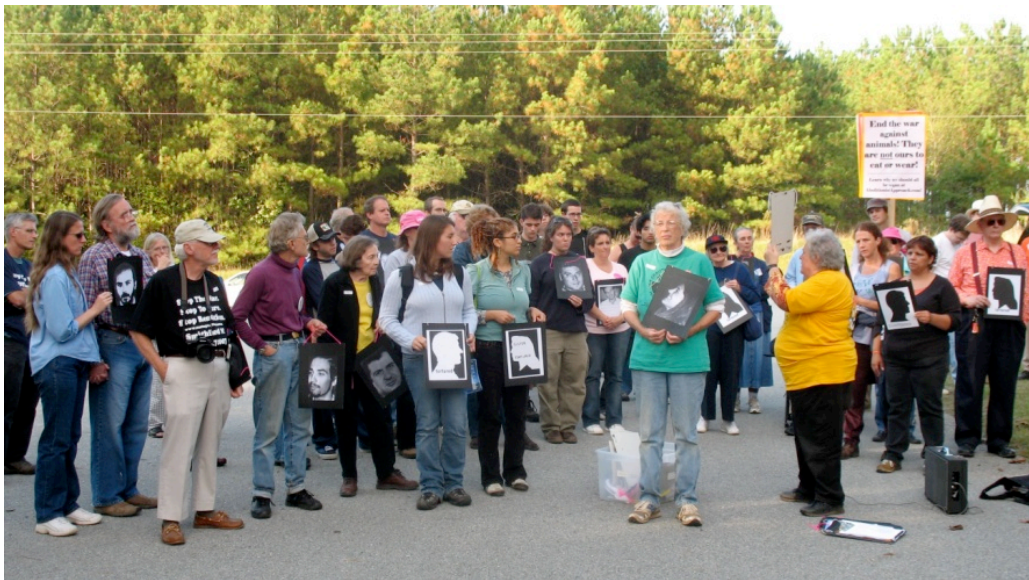
Fig. 20. Gathering at Aero. Chuck Fager. Doves & Eagles. 27 Oct. 2007. Web. < http://www.quakerhouse.org/smithfield-rally-05.htm >

As I looked down the tree lined street toward Aero, I saw approximately forty counterprotesters in 3-4 lines stationed in front of the fence. I counted about 15 or so American flags and one Marine Corps flag. I could only see one police car parked on the side of the road, close to the fence and only 3-4 police officers. About 50-75 of us congregated at the front of the road and began our vigil (see fig. 20).