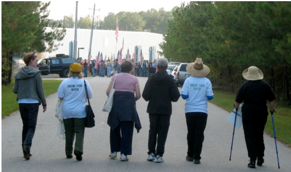
Fig. 22. Walking to Aero & Eagles. Chuck Fager. Doves & Eagles . 27 Oct. 2007. Web. < http://www.quakerhouse.org/smithfield-rally-05.htm >

We were instructed [by the rally organizers] to form lines of around 6-10 people and walk down the road toward Aero and the counterprotesters (see fig. 22). The groups were followed by small groups of counterprotesters and sometimes a single police officer. We began to quietly chant “we are all one” as we walked, many of us arm in arm. I was terrified for myself and the safety of my fellow activists. The chanting did help calm my fear (and my anger.)