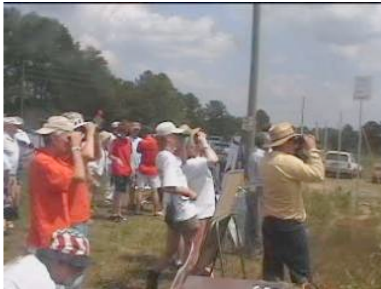
Fig. 23. Plane Spotting. NCSTN. "Actions and Vigils 2005-2007." October 2007. Web. < http://ncstn.spaces.live.com/ >.

employed by NCSTN was plane spotting. 35 Plane spotting had two purposes. First, it was used pragmatically to document proof of Aero's involvement in extraordinary rendition activities. Second, it was used rhetorically to stage visual media and raise awareness (see fig. 23).