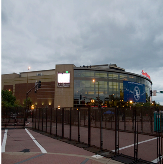
Fig. 2. Free Speech Zone at RNC Minneapolis.

Bradley. "Xcel Energy Center." Santa Cruz Independent Media Center. 4 Sept. 2008. Web. < http://www.indybay.org/newsitems/2008/09/04/18533032.php >