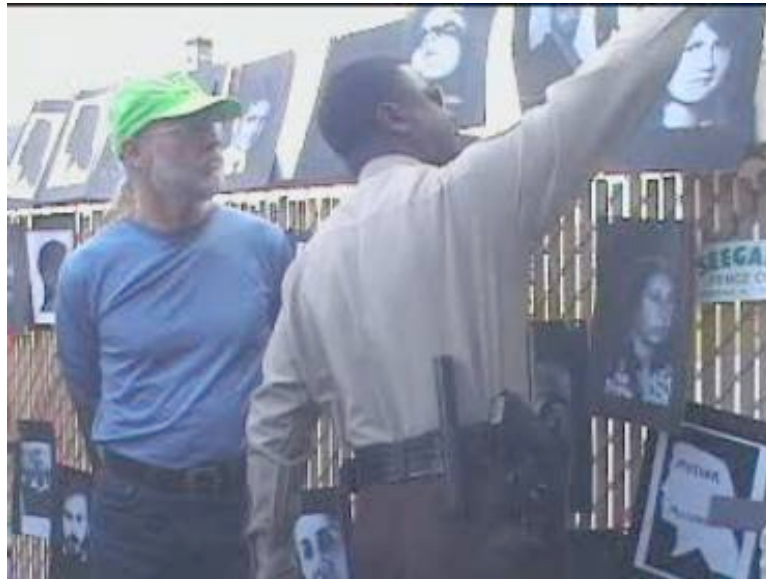
Fig. 15. Police officer fixes placard. NCSTN. Walk of Remembrance . 27 Oct. 2007. Web. < http://ncstn.spaces.live.com >

had no idea. A police officer stepped up and flipped the placard back over to the outside of the fence, but he didn't take it down. (see fig. 15). . . .