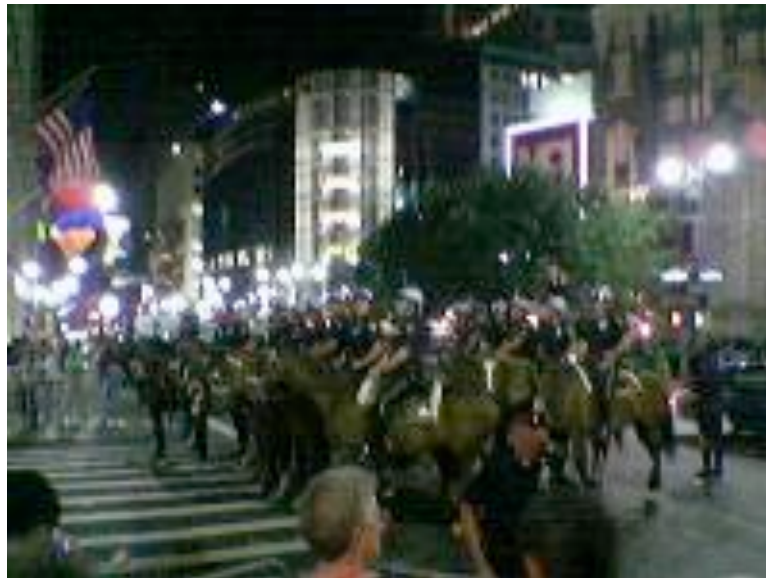
Fig. 5. Police Line at RNC in New York City. Portland Independent Media Center. 31 Aug. 2004. Web. < http://portland.indymedia.org/en/2004/08/296076.shtml >