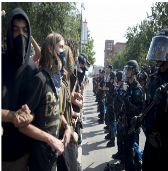
Fig. 3. Police Line at Democratic National Convention in Denver.

Bradley. "Xcel Energy Center." Santa Cruz Independent Media Center. 4 Sept. 2008. Web. < http://www.indybay.org/newsitems/2008/09/04/18533032.php >