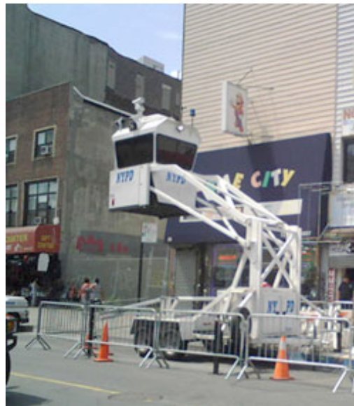
Fig. 9. NYPD Mobile Surveillance Tower. Joel Johnson. BoingBoing.net. 11 Aug. 2008. Web. < http://gadgets.boingboing.net/2008/08/11/sky-watch-nypds-mobi.html >

Less costly methods of police surveillance, which I have observed at virtually every protest I have attended, include the use of police patrols, photographing, and videotaping. Methods of surveillance in public spaces of protest are numerous and cover a range of technological sophistication beyond patrols, infiltration and videotaping. For example, mobile surveillance towers, also known as cherry pickers, (see fig. 9) have been increasingly used to monitor and police protest in public spaces.