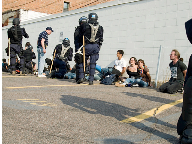
Fig. 11. Mass Arrest at Jackson and Seventh. Bradley. Santa Cruz Independent Media Center. 3 Sept. 2008. Web. http://www.indybay.org/newsitems/2008/09/03/18532436.php

Interestingly, the surveillance practices discussed above enable police to use snatch squads to target and remove protesters quickly from public spaces. Disciplinary space's