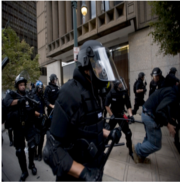
Fig. 4. Police Force at DNC in Denver. ex-Faultliners. San Francisco Bay Area Independent Media Center. 26 Aug. 2008. Web. < http://www.indybay.org/newsitems/2008/08/26/18530080.php >