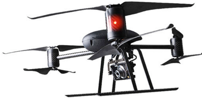
Fig. 10. Draganflyer X6.

requested use of similar military aircraft drones for domestic surveillance and border security. 10