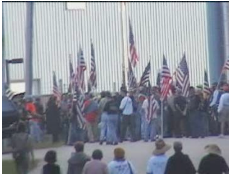
Fig. 18. Approaching the GOE and Gates at Aero. NCSTN. Walk of Remembrance . 27 Oct. 2007. Web. < http://ncstn.spaces.live.com >

I drove across town toward JNX for the next part of the protest to be held at Aero Contractors' headquarters. The plan was to conduct a walk of remembrance and vigil for victims of torture and hang placards with photos or silhouettes of torture victims on the fence at Aero Contractors' entrance. When we arrived we realized that the counterprotesters had not, in fact, gone home (see fig. 18 and 19).