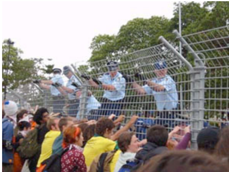
Fig. 7. Protesters shake the security fence surrounding the WTO meeting site in Olympic Park.

Similar structures and free speech zones have been constructed at democratic protests at neoliberal globalization and economic conferences, and lines of police officers in full riot gear have become a common sight (see figures 7 and 8).