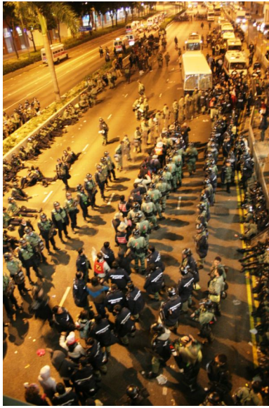
Fig. 8. Mass protests meet WTO in Hong Kong. Independent Media Center. 12 Dec. 2005. Web. < http://www.indymedia.org/en/2005/12/829714.shtml >

These cages, fences, and barricades with lines of police officers reveal the extent to which the perceived threat of public space has become entrenched.