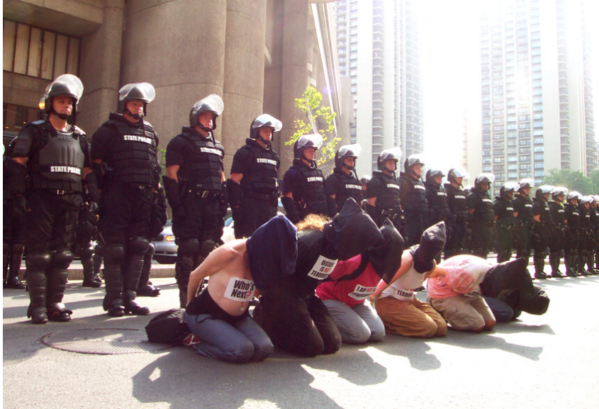
Fig. 6. Police Line at DNC in Boston.

Richard Goldman. "A candid glimpse of the mad spectacle surrounding the Democratic National Convention in Boston." San Francisco Bay Area Independent Media Center. 10 Aug. 2004. Web. < http://www.indybay.org/newsitems/2004/08/10/16916481.php >