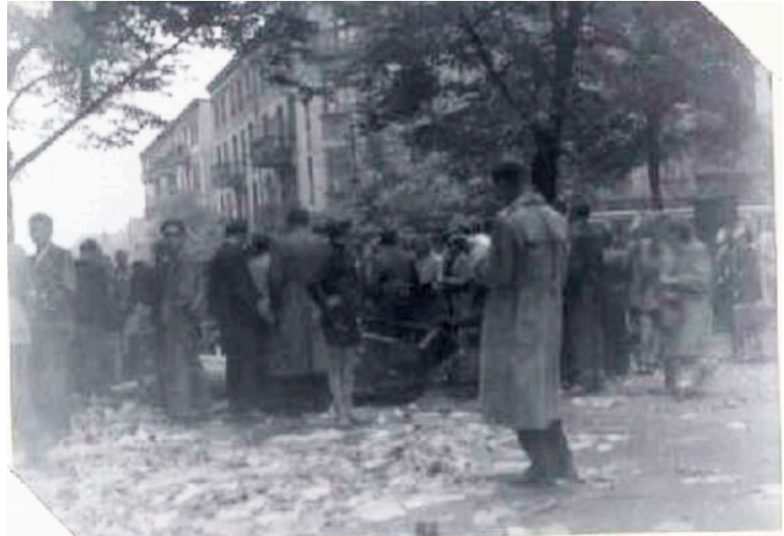
Figure 6: Left: Protesters raise the old Polish flag, banned by the Communist Government, at the city hall in Poznań during the June riots.