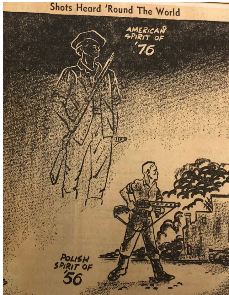
Figure 5: A Fourth of July cartoon printed in the days following the Poznań Riots comparing the revolutionary spirit between the American Revolution and that of the early stages of the 1956 thaw. Cartoon, The San Diego Union , July 4, 1956, Radio Free Europe Collection, Fonds No. 36, Polish Institute of Arts and Sciences of the Americas Archives, New York, New York.

On February 25, 1956 First Secretary of the Soviet Communist Party Nikita Khrushchev gave a speech at the Twentieth CPSU Party Congress that caused upheaval throughout the Soviet bloc. Barring international visitors from attending the speech, the audience was limited to exclusively Soviet delegates. Later labeled the “Secret Speech,” Khrushchev attacked the Stalinist regime