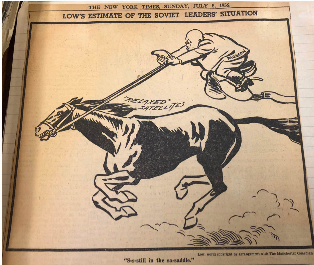
Figure 10: A cartoon published following the Poznań Riots mocking Khrushchev and Moscow's increasing loss of control over the satellite regimes. Cartoon, The New York Times , July 8, 1956, Collection 36, Polish Institute of Arts and Sciences of the Americas Archives, New York, New York.

In the weeks following the Eighth Plenum the domestic Polish magazine Po Prostu published an article contemplating the events that occurred in the wake of Gomulka's election. "What has happened in our country?" the article questioned. "To put it plainly and clearly, it might as well be said that the country has experienced a revolution. An actual economic-