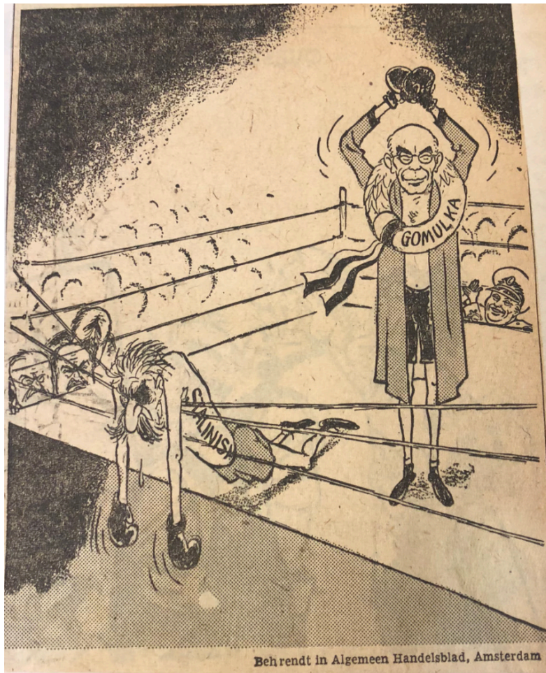
Figure 9: New York Times cartoon heralding Gomulka’s defeat of Stalinism. Cartoon, The New York Times , December 1956, Polish Institute of Arts and Sciences of the Americas Archives, New York, New York.

The trials for those arrested during the Poznań riots did not begin until late September 1956.