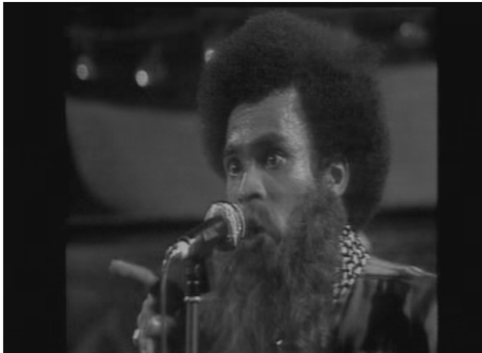
Example 11: Frame of “Rasputin” Music Video (1:17)

As the live performance sequence begins, the costuming of the band is immediately striking. All four are dressed in Arabian-like costumes (evoking a general sense of the exotic), complete with Central Asian hats, pants, and vests. To further exoticize the visual image, Farrell dons a fake beard to begin the performance of the song (Example 11). When he is not singing, Farrell joins the female trio in their imitation of Cossack dance, moving around the stage kicking out his feet in a style that resembles a stereotypical Western conception of a Russian folk dance.