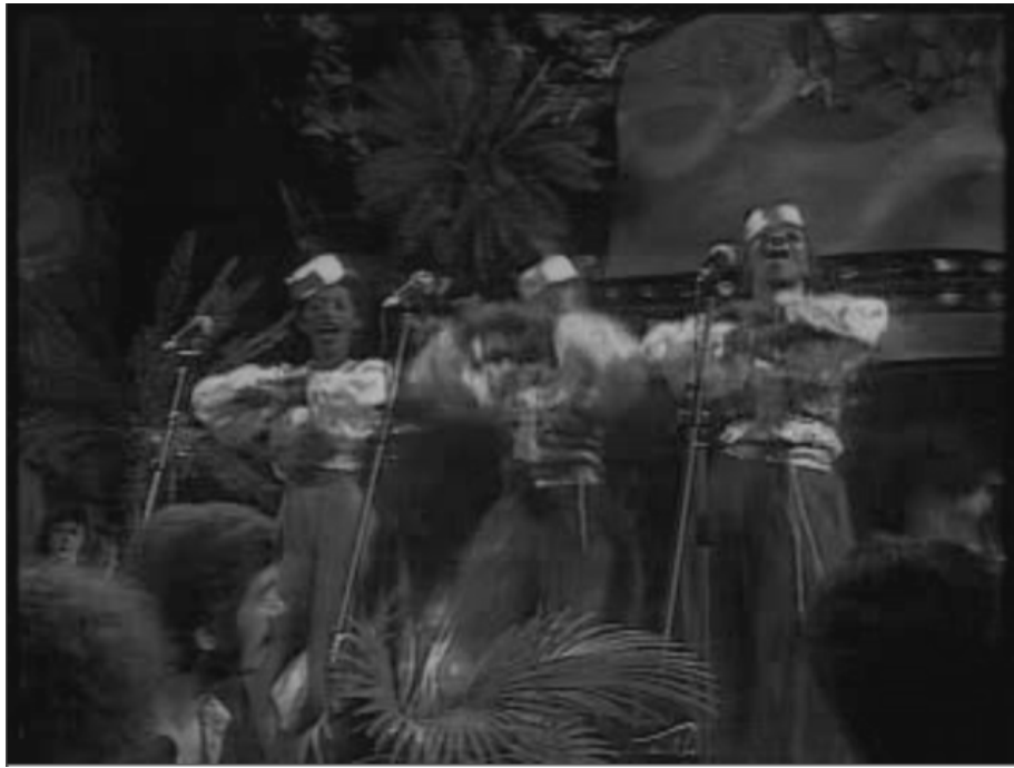
Example 10: Frame of "Rasputin" Music Video (1:55)

That the video uses real images from Boney M's tour in Moscow is significant: these images are the only actual representations of Russia given to the listener/viewer (the rest are exotic signifiers) and they furthermore embody a historic event as Boney M was the first music group allowed to film a music video in Red Square. 88 The narrative and locale depicted in the opening sequence of the music video clears up any potential ambiguity regarding the Russian nature of "Rasputin."