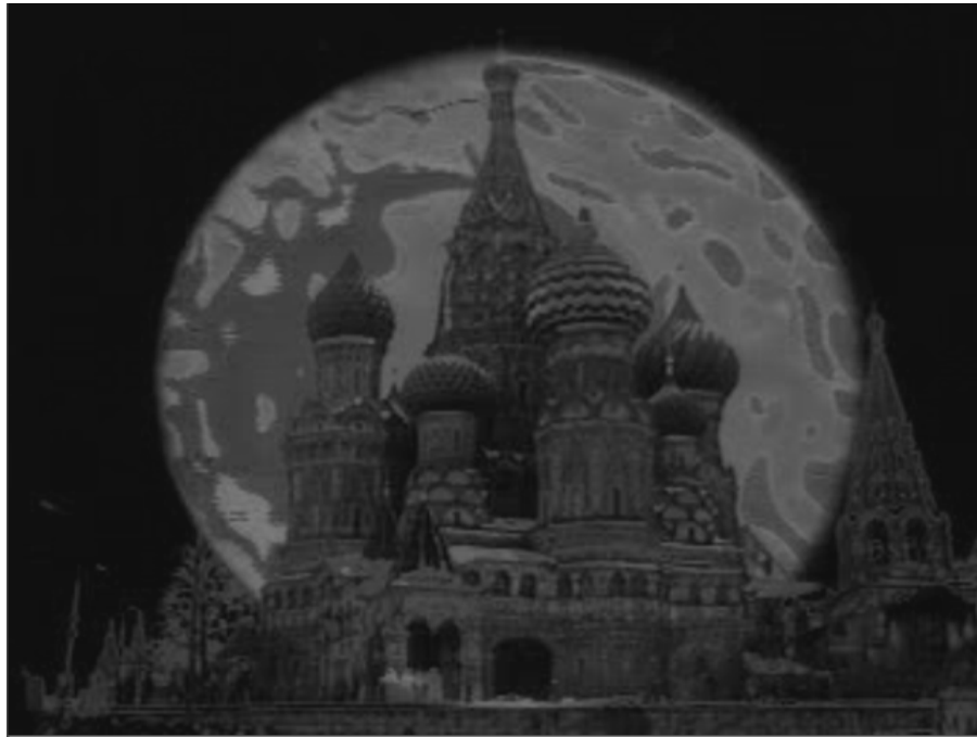
Example 9: Frame of “Rasputin” Music Video (0:01)

The music video of “Rasputin” opens with an image of St. Basil’s Cathedral, located at the southern edge of Moscow’s Red Square—one of the most iconic and familiar landmarks of Russia in the Western imagination. 87 The still image of the cathedral is not a picture, however, but a 3-D graphic representation (Example 9). Immediately following the image of St. Basil’s Cathedral is a sequence of Boney M deplaning in Moscow. The subsequent montage, lasting 44 seconds, portrays the group frolicking in Red Square, playing in the snow, and being photographed by a mob of paparazzi. There is additionally a prolonged segment in which Bobby Farrell struts across the Red Square. The sequence ends with a final succession of rapid photographs of the group.