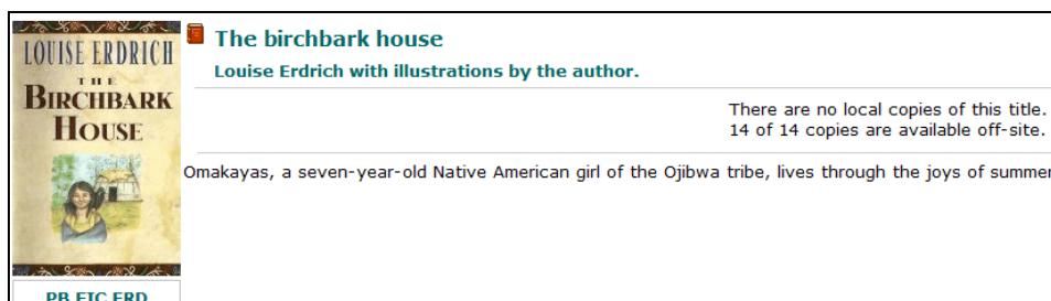
Figure 8: Record 3 - 14 Circulating Copies

I followed this process in each county, for each title/author search with multiple records returned. Circulating copies were added from each record.