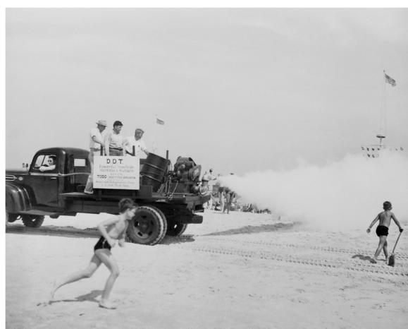
Figure 1 Fogger truck sprays Jones Beach in New York with DDT, 1945 (source: Corbis Images).

banned in 1972 (see timeline, Figure 2) [10]. p,p' -DDT exposure has been inconsistently linked to breast cancer despite having both estrogenic and carcinogenic properties [11,12]. Acute, high dose exposure to commercial DDT (which contains the more strongly estrogenic compounds o,p' -DDT and p,p' -DDT) has been shown to increase mammary cell proliferation in animal models [13,14] whereas chronic low-dose exposure through the diet is more predominately composed of the metabolite p,p' -DDE, which has little to no estrogenic effect [14]. DDT is still utilized to combat malaria, and more evidence regarding its role in possible health outcomes could either expand its use for vector control or encourage the use of other pesticides [15].