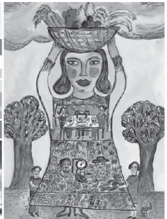
Community Health and Wellness Section from the Richmond General Plan 2030.