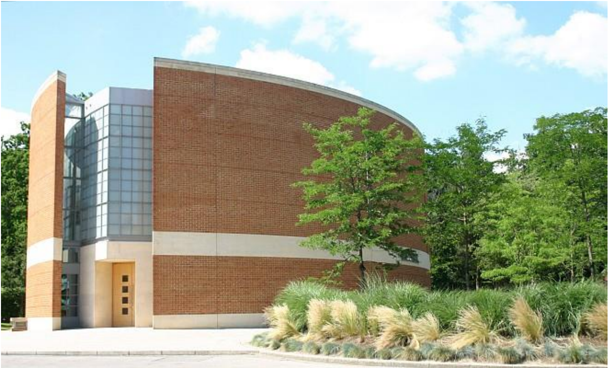
Figure 5. Falkland Islands Memorial Chapel, Front exterior of the chapel with memorial garden in the right foreground. http://www.falklands-chapel.org.uk/ . Accessed 4 December 2012.