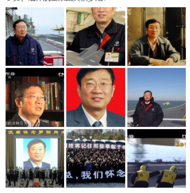
2017年11月25日 07:20 来自 微博 weibo.com

#那年今日#【还记得航母style吗?今天,向罗阳致敬!】5年前的今天,我国首艘航母"辽宁舰"成功起降歼-15舰载机。舰载机起飞画面一经播出,指挥员的手势随之走红。然而同一天,研制现场总指挥罗阳却倒下了...2012年,罗阳获选感动中国年度人物。今天,重温令中国人自豪的手势,缅怀航空报国英模罗阳!