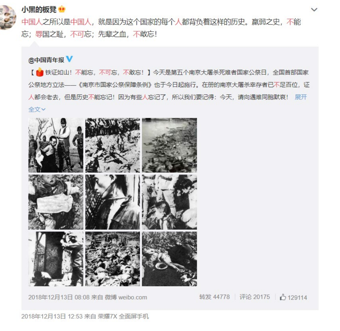
Figure 3: 12/3/2018 Weibo post from China Youth Daily commemorating the Nanjing Massacre, with additional user reposting and comments

China Youth Daily: "[Irrefutable evidence! [We] cannot forget! [We] must not forget! [We] dare not forget!] Today is the fifth Nanjing Massacre Memorial Day, the country's first local legislation for national memorial service the "Nanjing National Memorial Ceremony Protection Regulations" also came into force today. There are fewer than 100 survivors of the Nanjing Massacre on the books, witnesses will grow old, but history cannot be forgotten! Because some people have forgotten, so we must remember: today, please observe a moment of silence in tribute of the compatriot victims!"