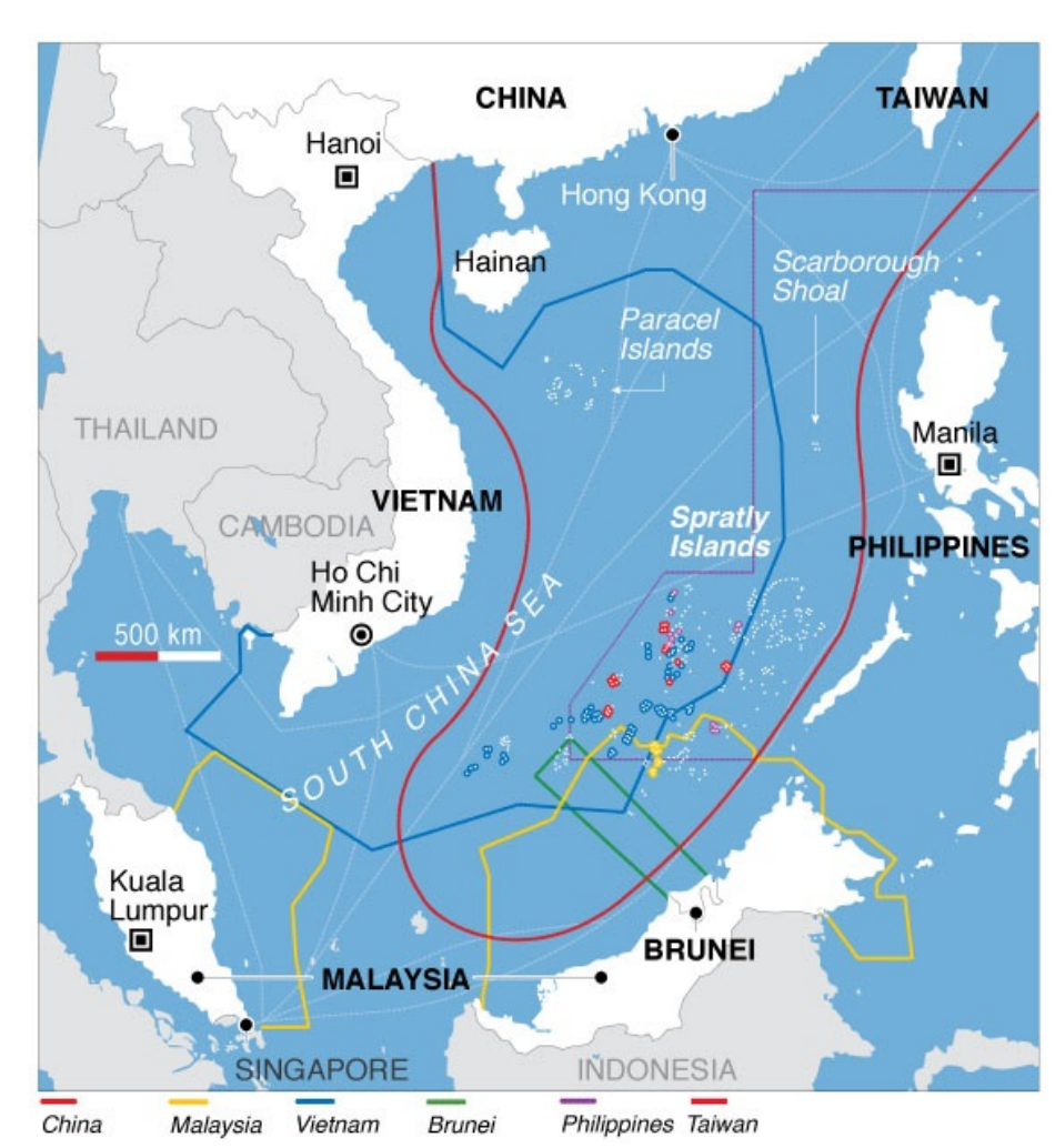
Figure 2: Map of Territorial claims in the South China Sea

The tribunal found that none of the Spratly Islands could be classified as legal islands because they cannot sustain a stable