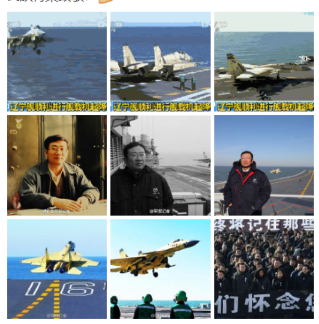
2018年11月25日 08:39 来自 微博 weibo.com

#军史今日#【还记得航母style吗?今天,向罗阳致敬! ♥】还记得航母style吗?2012年的今天,当国人通过电视目睹歼-15完美升空,舰上的罗阳却正在步入生命的倒计时;当公众用"航母Style"表达内心欢呼,缔造奇迹的航母功臣却猝然离世……这是属于中国的悲伤时刻,转发,向民族脊梁致敬! 🂪