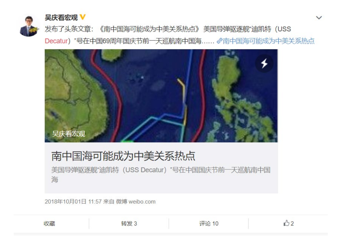
Figure 8:10/1/2018 Weibo post with an article link about the incident with the USS Decatur

Translation: "Released a headline article: 'The South China Sea may become a hot spot in Sino-American Relations,' the US guided missile destroyer "(USS Decatur)" cruised through the South China Sea one day before the 69<sup>th</sup> National Day of China."