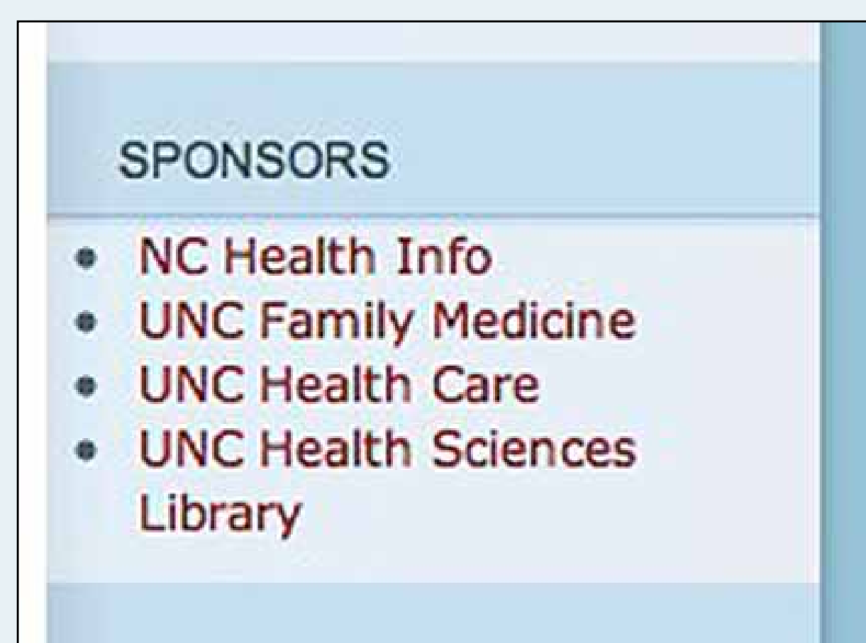
HSL and HSL's NC Health Info listed as YOUR HEALTH blog sponsors