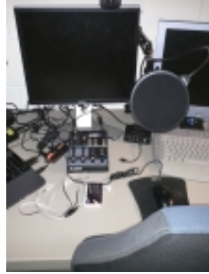
Figure 2. P22's closet, curtain, and microphone and mixer (photos sent through the diary postings).