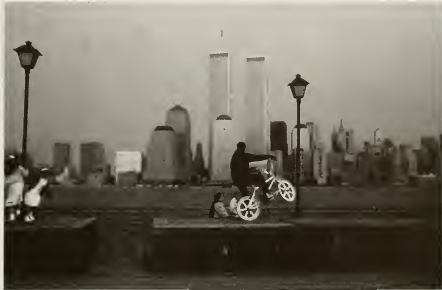
Grundy Park in Jersey City offers fine views of Manhattan's Financial Center.

The DEPE's 1984 walkway plan reflected the heady times and optimism of a period marked by development activity and public-private partnerships--a time when government regulators enjoyed substantial leverage over waterfront projects and permit applications. Today, with development along the "Gold Coast" down to a trickle, with foreclosures and auctions dotting the shore, progress on the walkway has come to a virtual halt, held hostage by the recession.