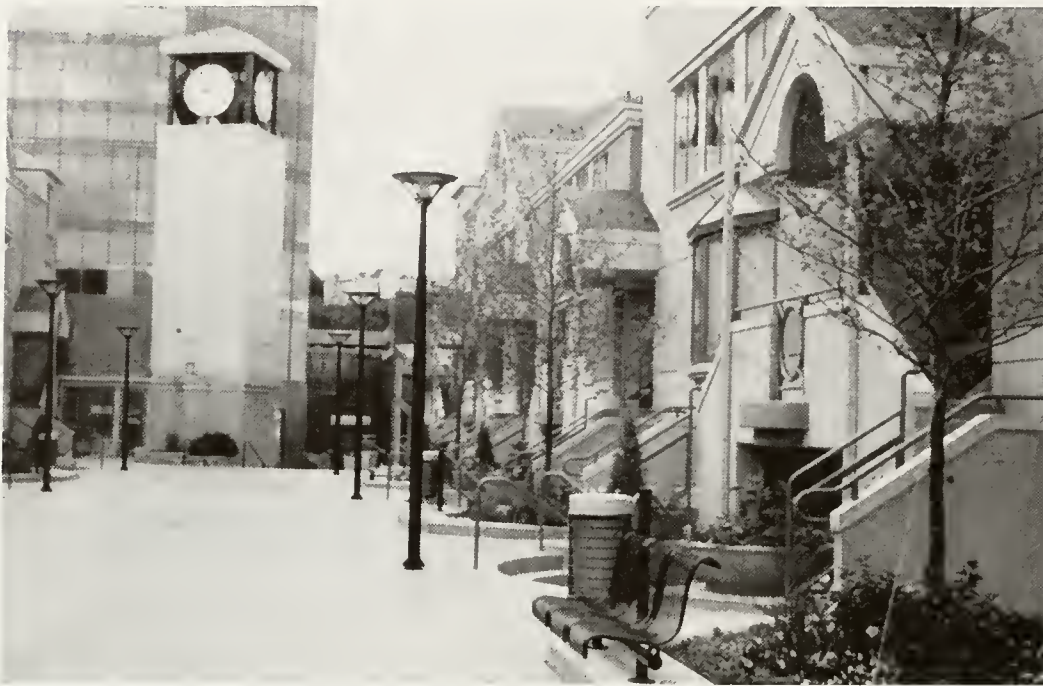
A walkway section of the Lincoln Harbor mixed-use redevelopment area in Weehawken.

accompanying the guidelines strongly recommends the establishment of penalties for non-performance of management duties, with the Conservancy monitoring all walkway easements.