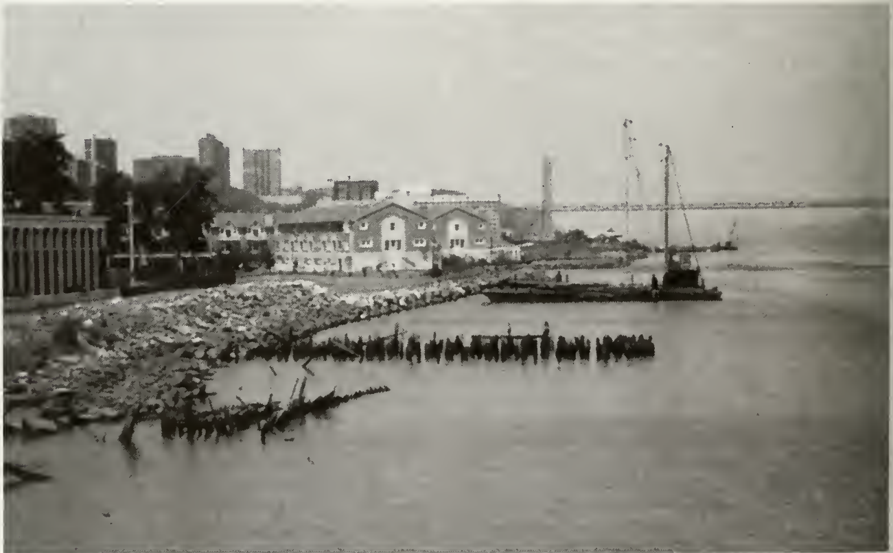
Underdeveloped Hudson River waterfront consists of rotting pier pilings and a soft edge.

The intent of the DEPE's 24-hour access policy is to enable the public to enjoy the walkway, as they would a waterfront sidewalk, at all times. The questions raised by the 24-hour policy, however, are complex. Isolated walkway sections have tended to attract undesirable activi-