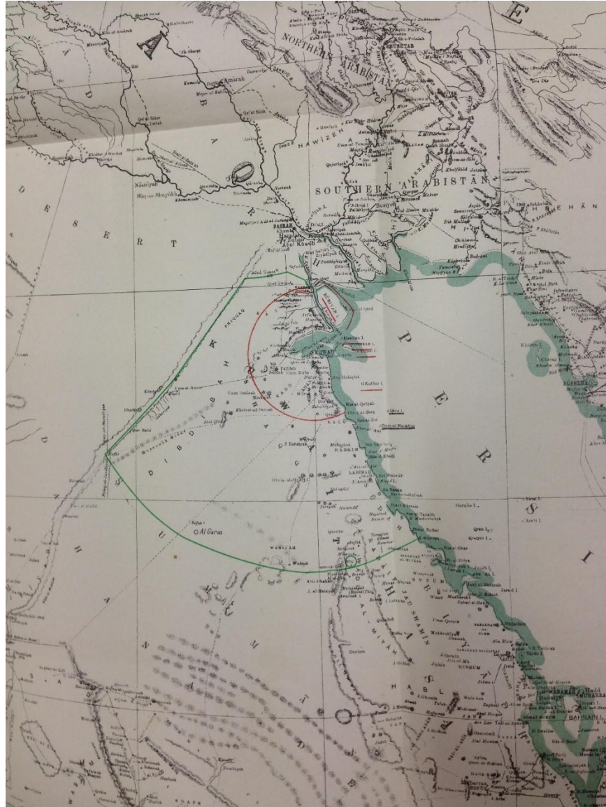
Figure 2 The Map of Kuwait's territorial boundaries after the signing of the 1913 Anglo-Ottoman Convention. 136