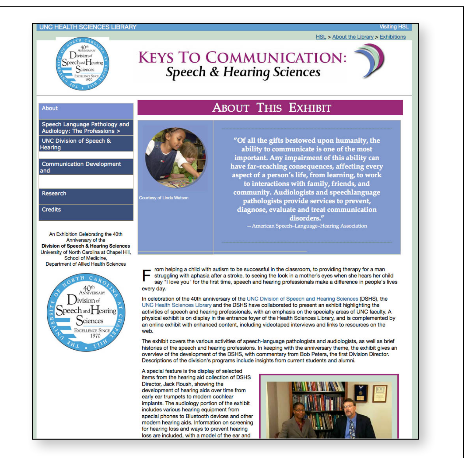
Speech and Hearing Sciences 40th Anniversary Online Exhibit