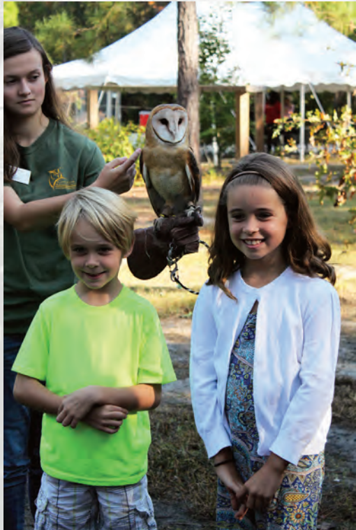
Above: It's time to hit the bike trails! Left and below: Young Family Fun Day attendees enjoy learning about wildlife and the woods.