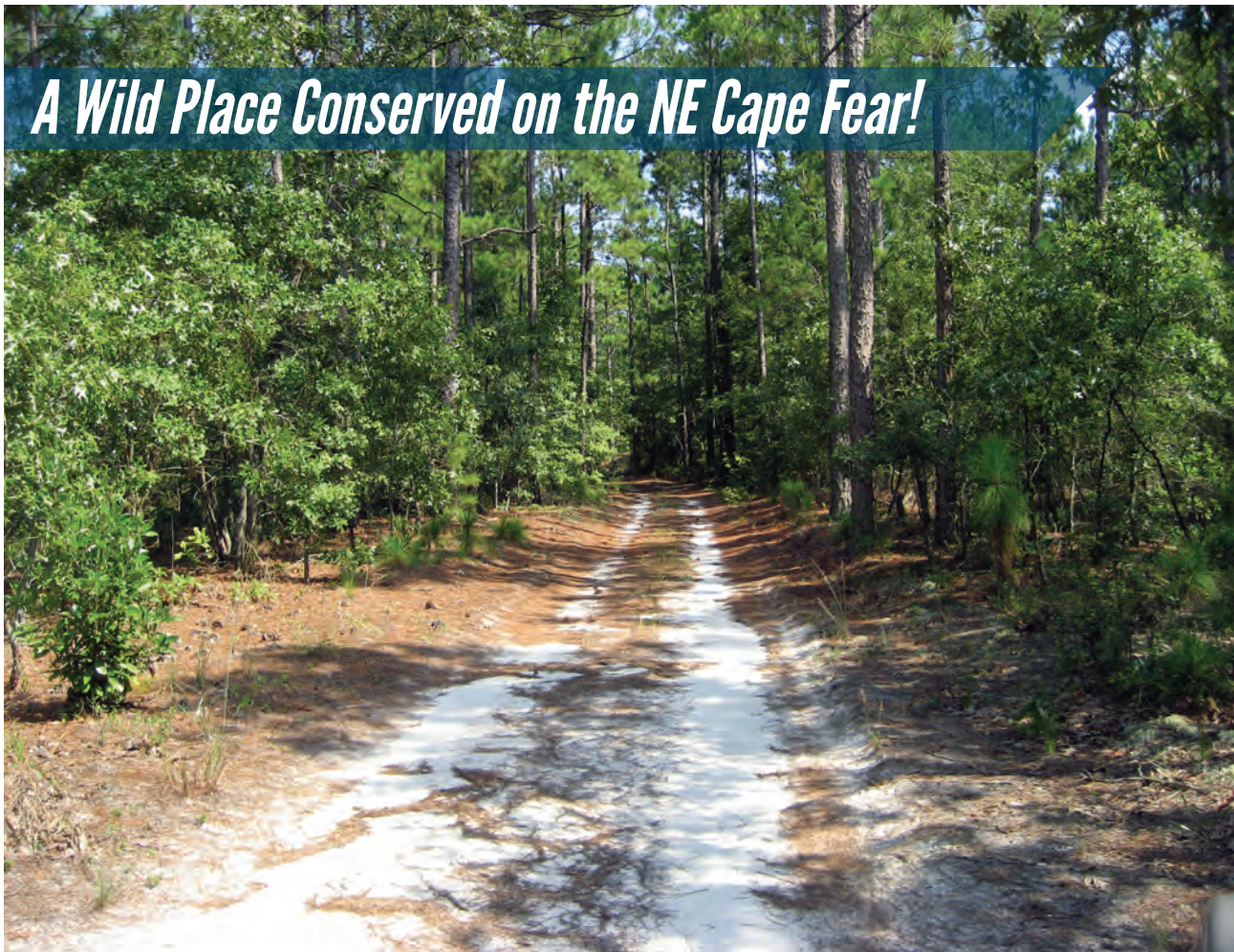
Tall trees and lush undergrowth can be found along the Northeast Cape Fear River.