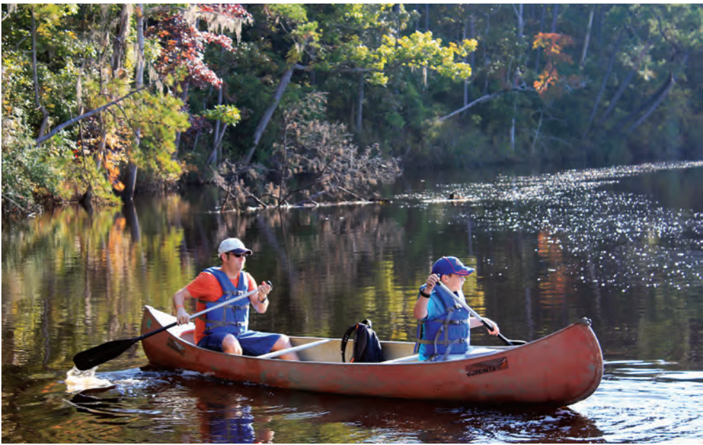
Above: Up the creek... with a paddle, of course.