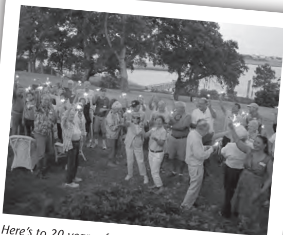
Here's to 20 years of saving those special places for everyone to enjoy!