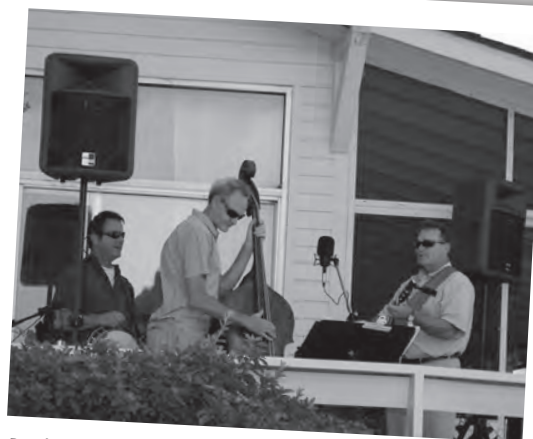
Back porch music from Masonboro Sound